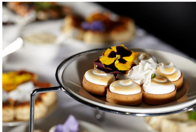
Top to Bottom: Pesto salmon with crushed potatoes Petit Fours