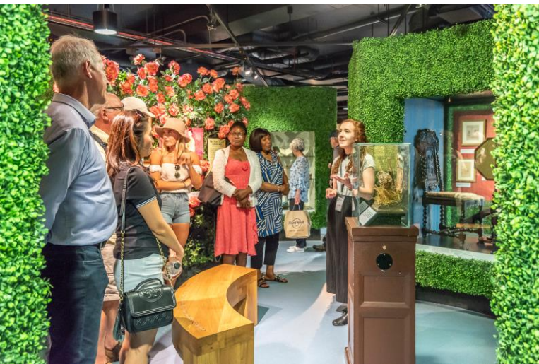
Top to Bottom: “Meet Miss Nightingale” performance Guided tour of the museum